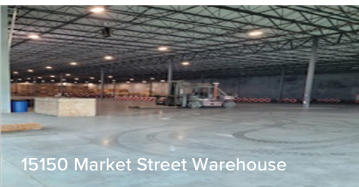
15150 Market Street Warehouse